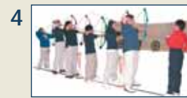
4 Each step of the shooting sequence is triggered by a command from the instructor.