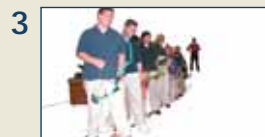
3 One whistle is blown to indicate that shooting can begin in a sequence of steps.