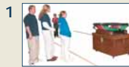
1 Start at the waiting line.