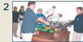
2 Proceed upon hearing two whistles to the shooting line.