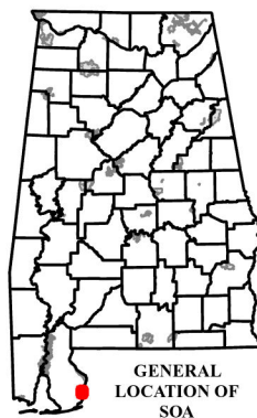
GENERAL LOCATION OF SOA