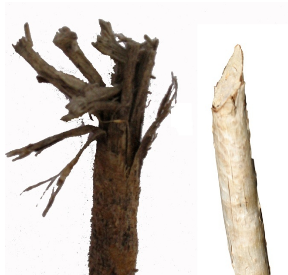
Figure 5. (Left) Cutting by a deer. (Right) Cutting by a rabbit. Note the clean 45-degree angle.

Rabbits rarely damage structures. If damage occurs it is usually in the form of gnawing on wood edges.