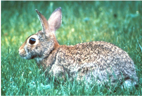
Figure 1. Eastern cottontail rabbit.