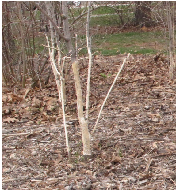
Figure 4. Unprotected trees severely girdled by rabbits.