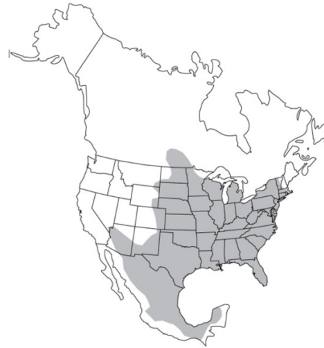
Figure 2. Range of the eastern cottontail in North America. Image by PCWD.

Rabbits generally are silent, but can emit a high pitched squeal when they are in distress.