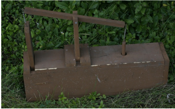
Figure 8. Rabbit box trap.

Cob corn (dry ear corn) or dried apples make good bait, even in winter. Impale the bait on the nail or position it at the rear of the trap (commercial traps may not have a nail). When using cob corn, use half a cob and push the nail into the pith of the cob; this keeps the cob off the floor and visible from the open door. Dried leafy alfalfa and clover are also good cold weather baits.