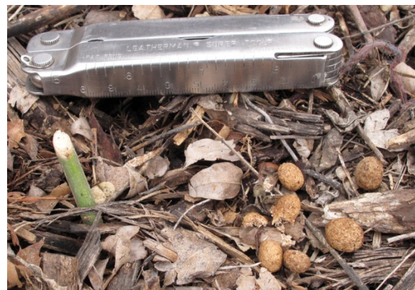
Figure 6. Rabbit droppings in winter tend to be filled with wood remnants.