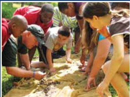
(LEFT) Students look for fish and invertebrates in the net during Creek Kids.