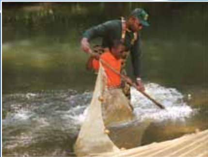
(RIGHT) A student helps seine a stream at Tannehill during Creek Kids.