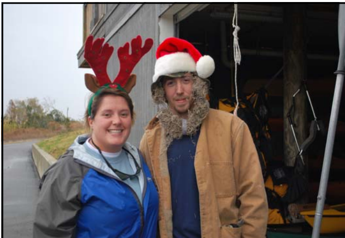
Our very own version of a delta Santa and his reindeer.