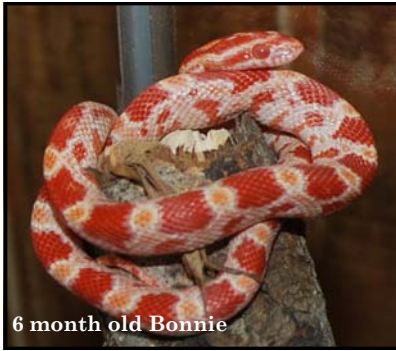
6 month old Bonnie