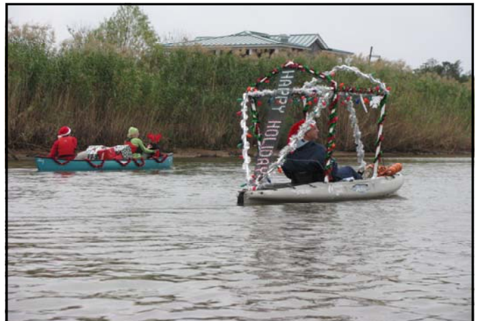
Last year's festive kayakers enjoying the day.