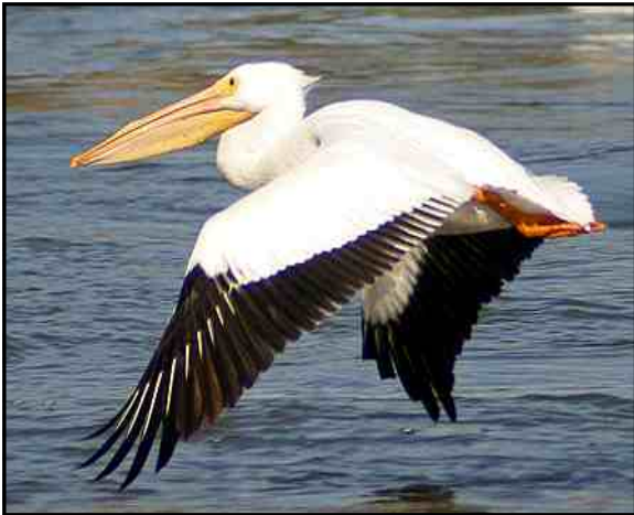
White Pelican in flight. You can see the black tips on his wings. These markings are only visible during flight.

Looking for a really good excuse to drag the canoe or kayak out this winter? Look no further! Some of our favorite snowbirds are in town – the American White Pelican. A short and easy paddle into Justin's Bay may take you into the middle of hundreds of these wintering birds feeding in the shallows, preening their feathers and waddling about socializing.