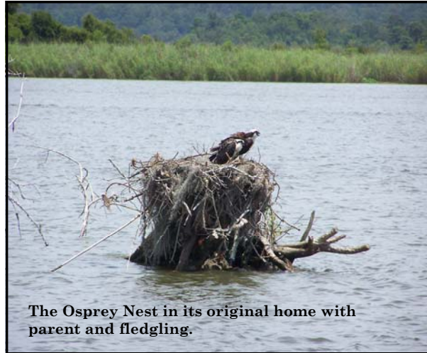
The Osprey Nest in its original home with parent and fledgling.

New exhibits are always exciting for 5 Rivers staff, and our latest is no exception. This spring we noticed something very out of place on the Apalachee River. An osprey nest was perched precariously close to the water. While they typically build their nest in treetops 20-30 feet above the water, this nesting pair decided to build upon a fallen tree just a few feet above the water. While this gave a unique viewing opportunity for guests aboard The Pelican pontoon boat, a single tropical storm surge could have destroyed the nest and the chick inside.