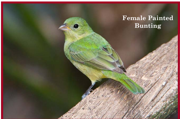
Female Painted Bunting

For us, spotting Painted Buntings is not something we can do all year round. They spend their summers along the Atlantic Coast from the Carolinas to Florida. When winter comes, they migrate to Mexico to keep warm. This time of year though, they are making their way back to their summer homes and stopping in our area for a break before they continue on their way. If you are interested in trying to entice the Painted Bunting to your yard, put white millet in your feeder, which is the round seed found in basic seed mix. This is the seed they prefer. They are shy when it comes to larger birds, so consider feeders that allow small birds in, but keep larger birds out.