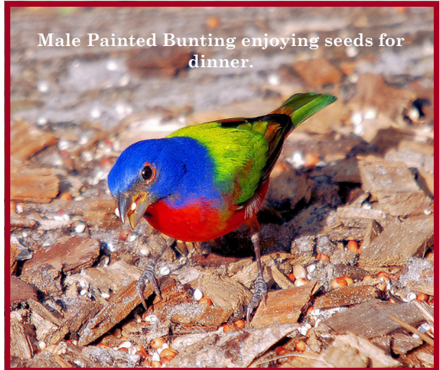
Male Painted Bunting enjoying seeds for dinner.

Here at 5 Rivers, we have spotted the Painted Buntings in our woods. Stop by for an afternoon stroll to see if you can catch a glimpse of this striking bird before it makes its way back to its summer home.