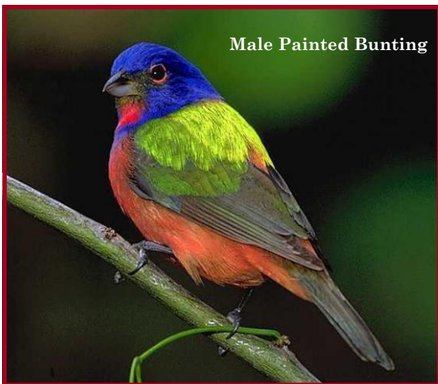
Male Painted Bunting

When it comes to eating, Painted Buntings will gather insects, insect larvae, and even spiders during the spring and summer months. They have even been known to pick bugs out of a spider's web. In the fall and winter, the Painted Bunting becomes a seed eater. The males are very territorial and very aggressive.