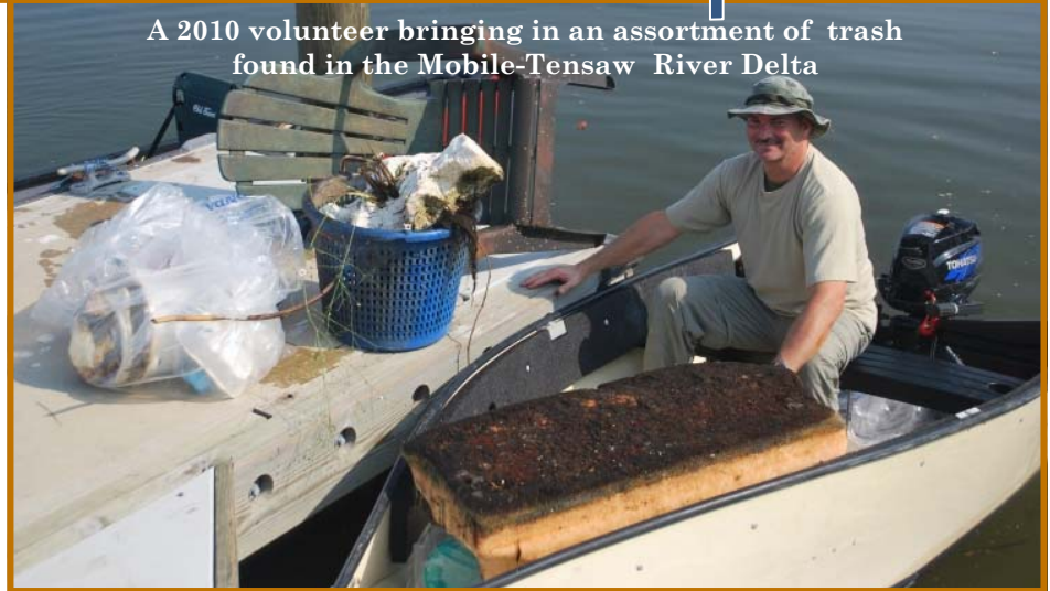
A 2010 volunteer bringing in an assortment of trash found in the Mobile-Tensaw River Delta

23 years has passed since the Alabama Department of Conservation and Natural Resources (State Lands Division, Coastal Section) and the Alabama People Against a Littered State (PALS) first teamed up to help "get the trash out of the splash" and clean Alabama's coastline. So far 31,213 volunteers have come together to help pick up 1,169,844 pounds of marine debris along 3,917 miles of coastline! Now YOU can join the effort and help keep our coast clean by becoming a volunteer in the 24th Annual Alabama Coastal Cleanup. This year's cleanup is scheduled for