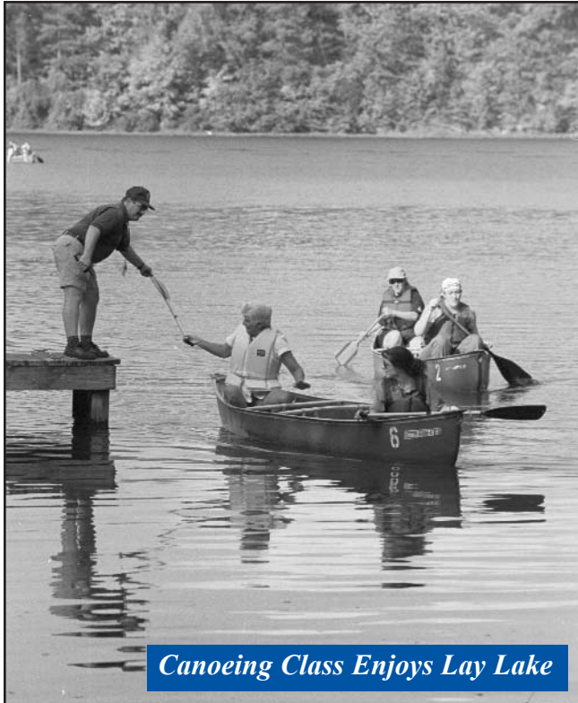
Canoeing Class Enjoys Lay Lake