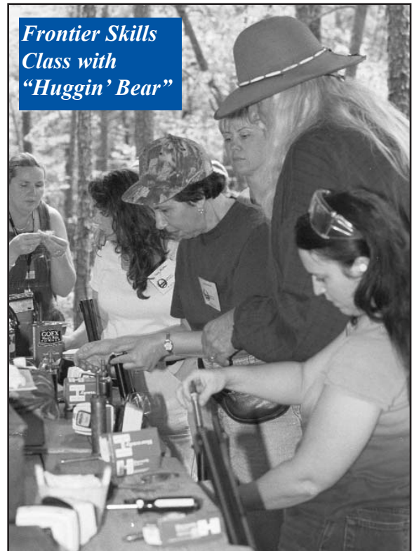
Frontier Skills Class with "Huggin' Bear"