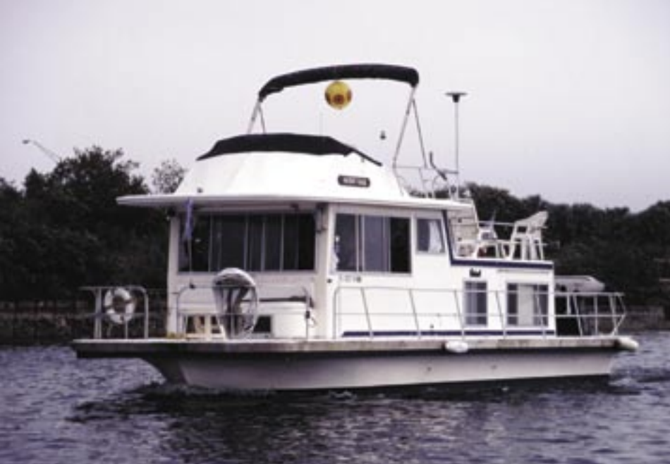
US COAST GUARD