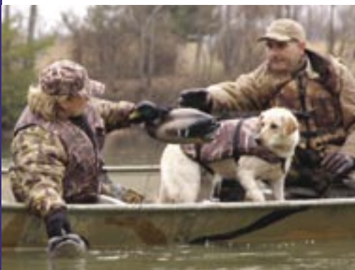
US COAST GUARD