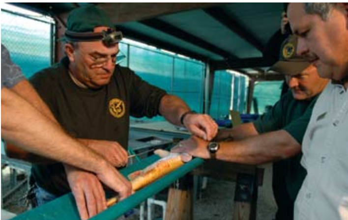
Biologists implanting a sonic tag in the Alabama sturgeon.

After consultation with the USFWS, it was decided this specimen would be most valuable by releasing it back into the Alabama River. However, the fish would be implanted with a 48-month sonic tag in the abdominal cavity to allow fisheries biologists to track its movements. The sonic tag sends out a series of beeps that are received by a sonic receiver listened to by biologists. The sonic tag has a unique series of beeps coded for a particular tag so biologists know which fish they are tracking if multiple fish are tagged in the same area. While numerous movement studies have been conducted on many fish species, this is the first study of its kind for this rare species.