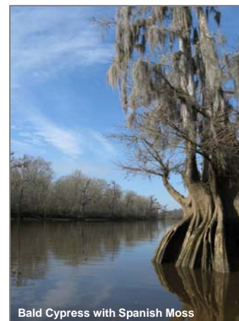
Bald Cypress with Spanish Moss