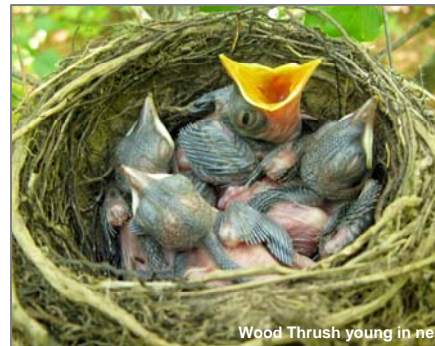
Wood Thrush young in nest

The Pinhoti Trail begins near Weogufka, AL, and connects to the Benton MacKaye Trail near Blue Ridge, GA, covering a distance of 335 miles. Of the 335 miles, 172 miles are in Alabama. By continuing onto the Benton MacKaye Trail and heading east, you will come to Springer Mountain, the southern terminus of the Appalachian Trail.