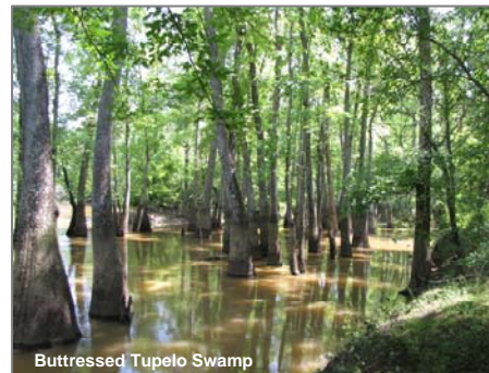
Buttressed Tupelo Swamp