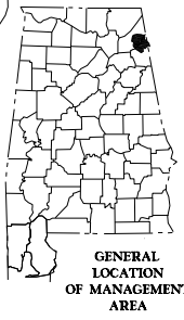
GENERAL LOCATION OF MANAGEMENT AREA

THE DEPARTMENT OF CONSERVATION AND NATURAL RESOURCES DOES NOT DISCRIMINATE ON THE BASIS OF RACE, COLOR, RELIGION, AGE, SEX, NATIONAL ORIGIN, DISABILITY, PREGNANCY, GENETIC INFORMATION OR VETERAN STATUS IN ITS HIRING OR EMPLOYMENT PRACTICES NOR IN ADMISSION TO, ACCESS TO, OR OPERATIONS OF ITS PROGRAMS, SERVICES OR ACTIVITIES.