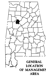
GENERAL LOCATION OF MANAGEMENT AREA

This map is your ANNUAL permit to hunt all game in accordance with the seasons, rules, and regulations listed hereon, This permit must be signed and in your possession to be valid. 2019-2020 Season Permit