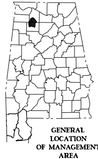
GENERAL LOCATION OF MANAGEMENT AREA