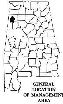
GENERAL LOCATION OF MANAGEMENT AREA

THIS IS NOT A SURVEY. BOUNDARIES REFLECT INFORMATION PROVIDED AT THE DATE OF REVISION. THE ALABAMA DEPARTMENT OF CONSERVATION CANNOT ACCEPT RESPONSIBILITY FOR INACCURACIES RESULTING FROM UNOBTAINABLE OR UNKNOWN DATA. THIS PUBLICATION IS AVAILABLE IN ALTERNATIVE FORMATS UPON REQUEST.