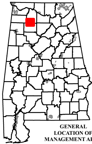
GENERAL LOCATION OF MANAGEMENT AREA

THE DEPARTMENT OF CONSERVATION AND NATURAL RESOURCES DOES NOT DISCRIMINATE ON THE BASIS OF RACE, COLOR, RELIGION, AGE, SEX, NATIONAL ORIGIN, DISABILITY, PREGNANCY, GENETIC INFORMATION OR VETERAN STATUS IN ITS HIRING OR EMPLOYMENT PRACTICES NOR IN ADMISSION TO, ACCESS TO, OR OPERATIONS OF ITS PROGRAMS, SERVICES OR ACTIVITIES.